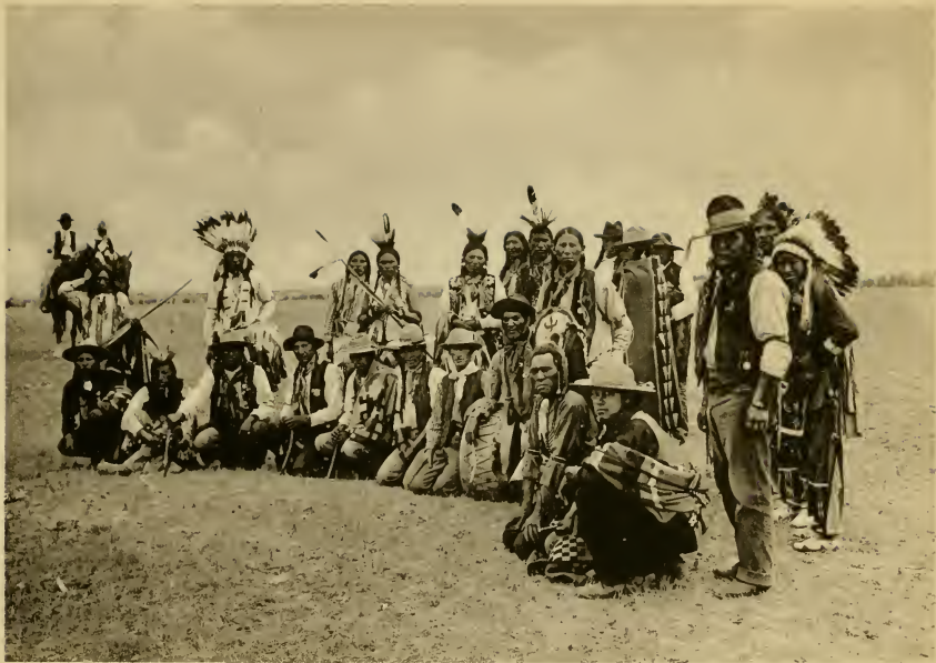
A BUNCH OF BUCKS.